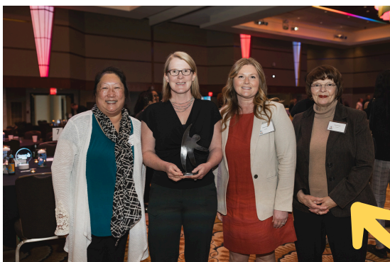
2025 Champ Award recipient First Day Shoe Fund