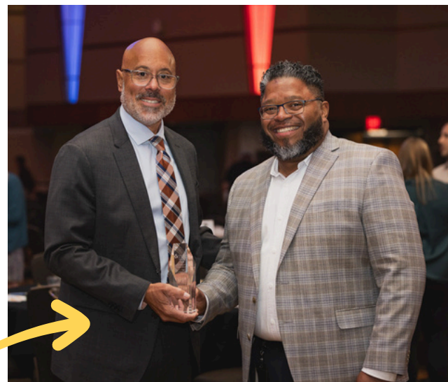
2025 Diether Haenicke Promise of Excellence Award recipient The Kalamazoo Promise