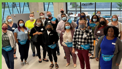
Photo: Team captain kick-off celebration